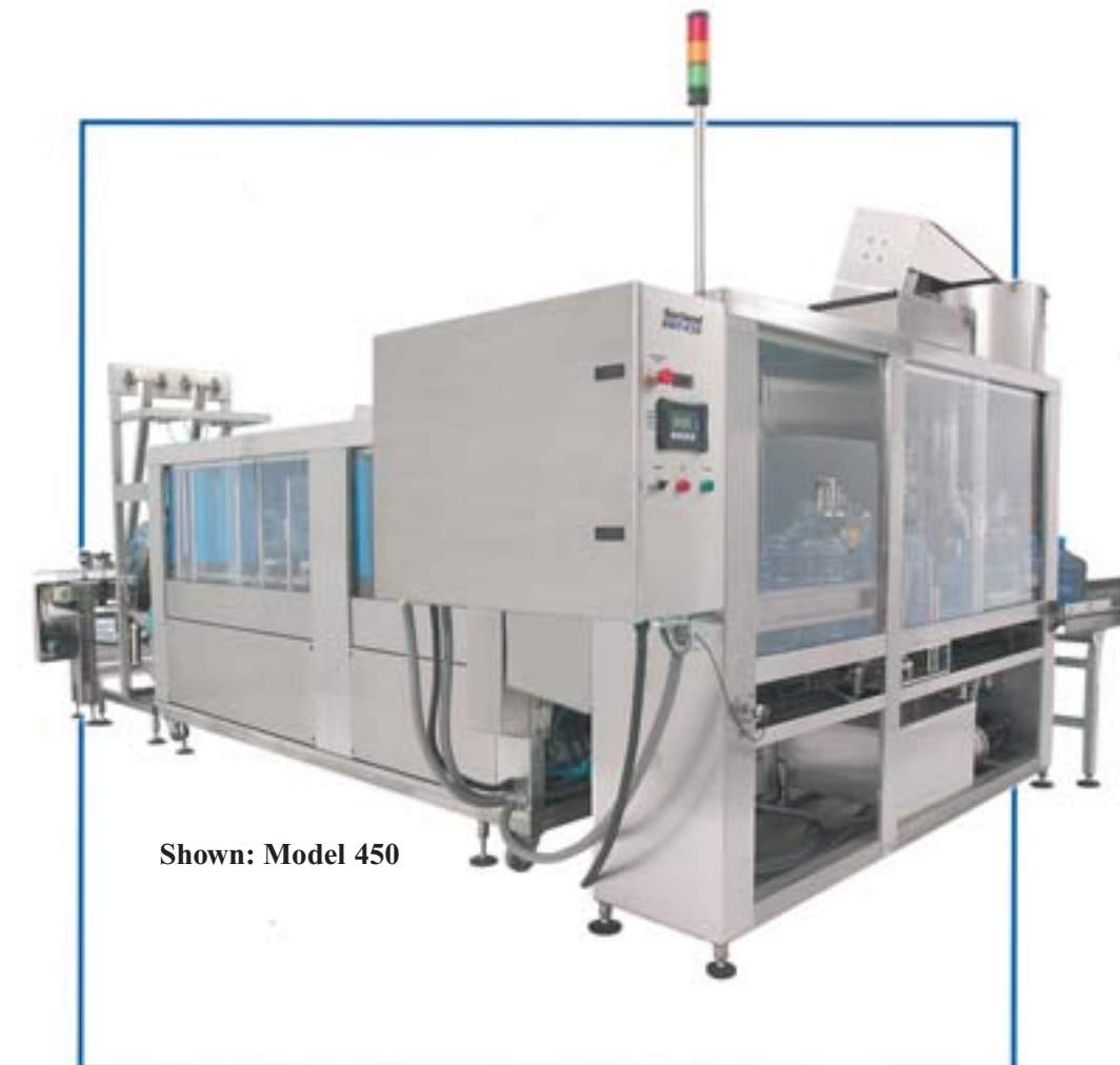
Shown: Model 450

Automatic Bottle Washer/ Filler/Cappers: 450-, 600- and 900 BPH Available